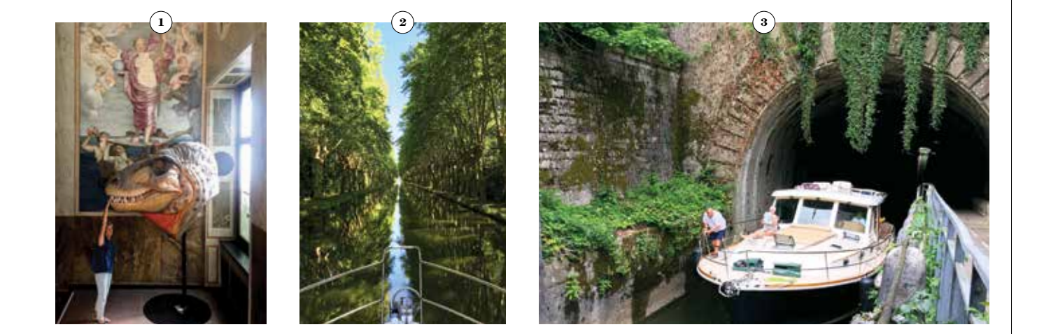
Visiting the Natural History Museum Basel in Switzerland. 2. Slow cruising through Nordhouse, France. 3. It's a tight fit as True East exits a tunnel while cruising French canals. 4. A quiet morning on the canal. 5. Exploring museums in Luxembourg. 6. A waterfront view in Smögen, Sweden.